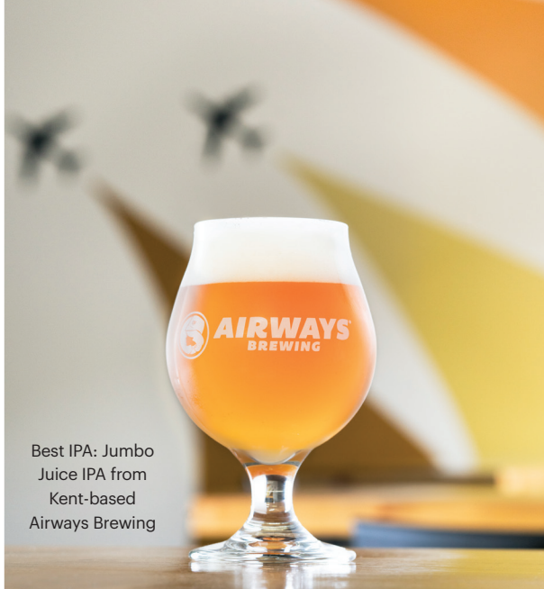
Best IPA: Jumbo Juice IPA from Kent-based Airways Brewing

BREWERY AND TAPROOM (21 +): Kent, 8611 S 212th St.