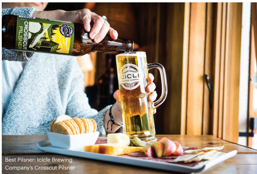
Best Pilsner: Icicle Brewing Company's Crosscut Pilsner

brand-new $100 bill: crisp, clean and begging to be consumed. It pours sparkling clear and golden, with a thin white head that smells slightly hoppy and a wee bit bready. Head brewer Dean Priebe created a beer that refreshes the palate with a tactful combination of subtle flavors: just a bit of honey, corn and straw, then the tiniest hint of herbal hop spiciness provides a little pop of bitterness on the finish. Available in bottles at select bottle shops and always on tap at the brewery, where you can get growlers to go.