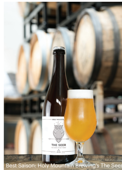
Best Saison: Holy Mountain Brewing's The Seer

A traditional Belgian style of beer that was originally brewed seasonally for summertime consumption, saison (the French word for season) has become a popular year-round style in America. Pale in color, cloudy in complexion, it has a flavor that is often a bit fruity and even spicy.